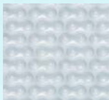
Clear 500 Micron

Sunlover Heating pool blankets are designed to deliver long life in an environment dominated by UV laden solar rays, chemicals and salt.