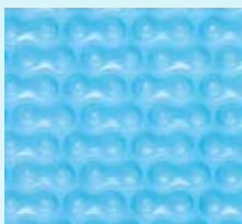
Reef Blue 400, 500 Micron