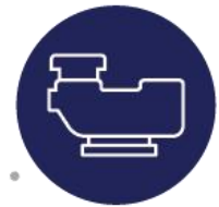
Variable Speed Pump